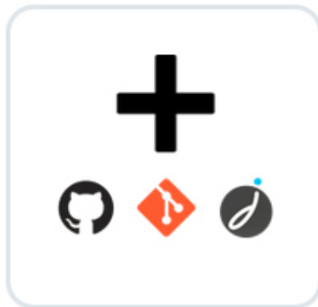
Create a new repository