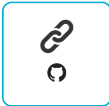
Link to an existing repository

When creating a new project in IBM Bluemix DevOps Services, which action is performed when Link to an existing repository is selected?